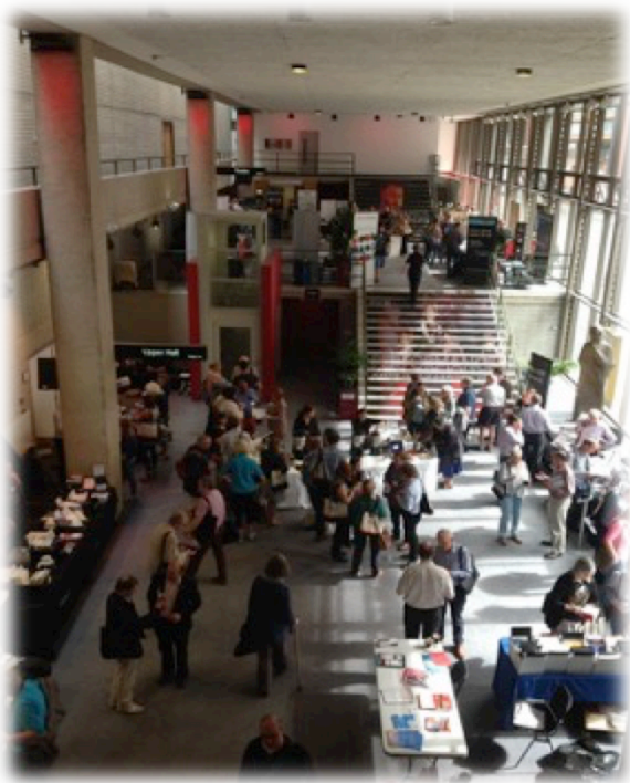
The RNCM Concourse

The RNCM has excellent lecture theaters with outstanding acoustics. The main concourse, tiered over three interconnected levels, will host the vendor exhibition and catering. The RNCM's public spaces will provide an architecturally impressive backdrop for the conference mixer.