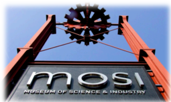
The Manchester Museum of Science & Industry

The Museum of Science & Industry will host pre-dinner drinks in the Power Hall with an outstanding collection of working steam engines. Dinner will be served in the Revolution Manchester gallery that celebrates the city's rich legacy of industrial innovations and scientific discoveries.