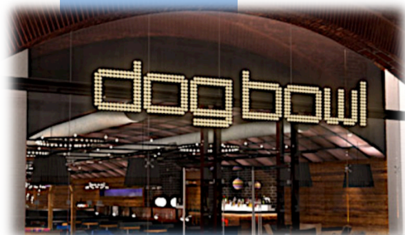
The Manchester Dog Bowl

The annual meeting famously enables delegates to network in a relaxed atmosphere. To facilitate this BMSS have secured the exclusive use of the 'Dog Bowl' - featuring five bowling lanes, a restaurant, and bar for 160 people. Complimentary refreshments and light food will be provided.