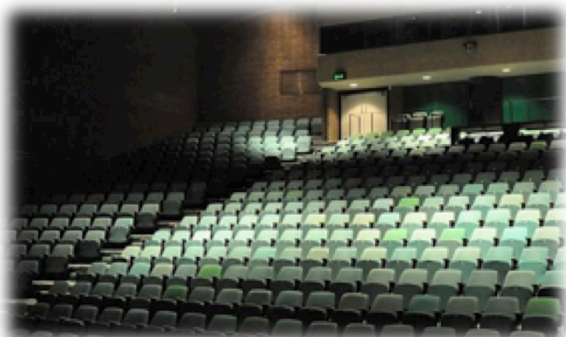
The RNCM Theater